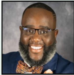
President JUSTIN CAMPBELL Commissioner, City of Palatka