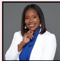
Sergeant-At-Arms FELICIA BRUNSON Mayor, City of West Park