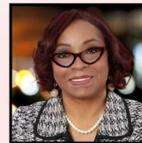
Historian DIANNE WILLIAMS-COX Commissioner, City of Tallahassee