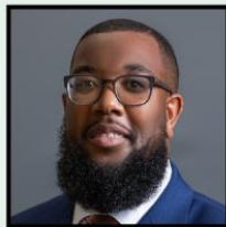
Parliamentarian JOHN TAYLOR Mayor, City of Opa-locka